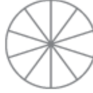
6-inch: 10 traditional slices

Our 8-inch cakes can be cut to serve 16-20 traditional slices. It can also be cut to serve 24 event style slices.