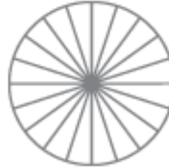
8-inch: 20 traditional slices

Our two-tiered cakes are 8" + 5". Our two-tiered cakes can be cut to serve a total of 30 servings. The 8" can serve 24 event style slices and the 5" can be cut to serve 6 slices.