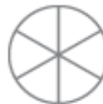
5-inch: 6 traditional slices

Our three-tiered cakes are 9" + 6" + 4". Our 9-inch cakes can be cut to serve 30 event style slices. Our 6-inch can be cut to serve 10 slices and our 4-inch can be cut to serve 5 slices, a total of 45 servings.