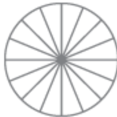
8-inch: 16 traditional slices

Our 8-inch cakes can be cut to serve 16-20 traditional slices. It can also be cut to serve 24 event style slices.