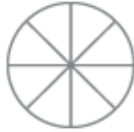
6-inch: 8 traditional slices

Our 6-inch cakes can be cut to serve 8-10 traditional slices.